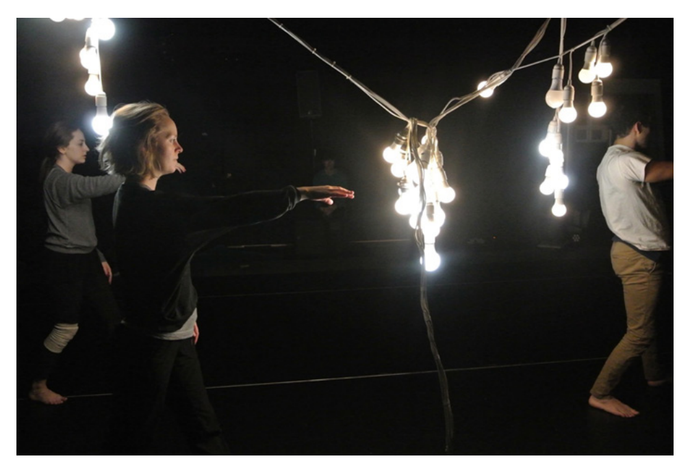
Figure 4: Instances of the final Lanterns system

It is tempting to conclude with this indifference as evidence of the intrinsic asymmetry between living and non-living systems (difference in kind). Andrew Culp has proposed asymmetry as a generative diagram for mapping this difference which can be applied to this situation if we replace "terms" with "systems": "asymmetry works to impede reciprocal relations and prevent reversibility. It diagrammatically starts by constituting two formally distinct terms as contrary asymmetry. It is maintained by concretely establishing a relationship of incommensurability between their sets of forces." Culp juxtaposes asymmetry to complexity, which he calls "flattening," and an "equalization of inequality," which amounts to a kind of reductive scientific mysticism. It seems that by reviving Deleuze's concept of the irreducible inequality (here a productive operator generative of difference), Culp's gesture would lead us to space in which the non-human system could speak for itself on its own terms, even if there's no sense to be made of its speech act.