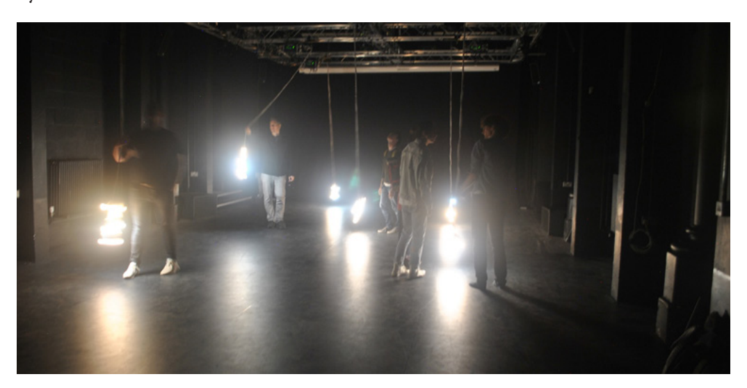
Figure 1: Interaction with the Lanterns system

Theatrical hardware yields computational control over the brightness of each individual light bulb. We employ some simple mappings for sonification and animating the lights, which can be seen in documentation videos. We will discuss how we arrived at these mappings and their implications after we have given some background on how we arrived at this configuration for our system.