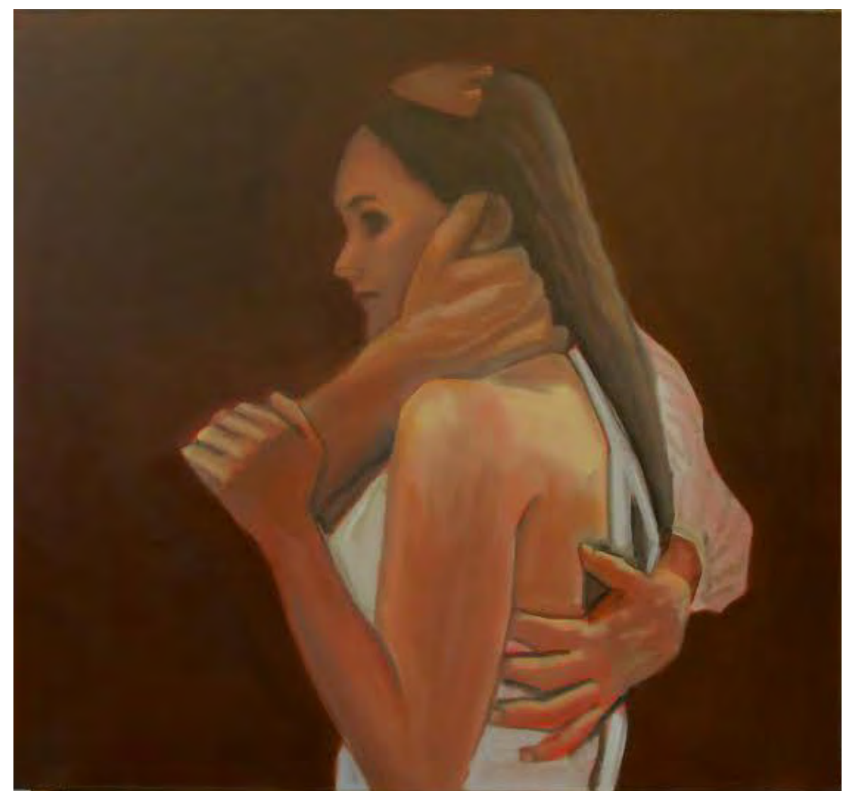
Yitzhak Livneh, 2009.

the lover, who has failed the woman, out of the family album; yet at the same time it also points towards an archaic belief that one can operate on the world through the image, or the thought of the magical power of the visual image. And here it seems that Nochlin's connection between the representation of a cut body, a cut of the body stemming from the cut of the frame, and real cutting now takes on meaning and validation: the cut at stake in Livneh's paintings can only be made on a photographic image, and the painterly repetition of the act of cutting constitutes a second generation of representation. The very act of painting emphasizes the pictorial past of the amputation, while turning both the act of cutting and the gap between photographic cutting and the actual cutting into the subject of the painting. Since the creation of the image is necessarily interlaced with an actual cut of a represented image, the painting conjugates these two distinct operations. And indeed, in one of the paintings from the series, the character in the painting, the one who supposedly cut the image of the lover who disappointed her out of the picture, holds a knife in her hand and cuts a salad. Furthermore, the series of paintings revolves around the relation between presence and absence, and the continuous visibility of the one who was banished from the photographs, while the palms of his hands continue to bustle within it, like bizarre creatures with a life of their own.