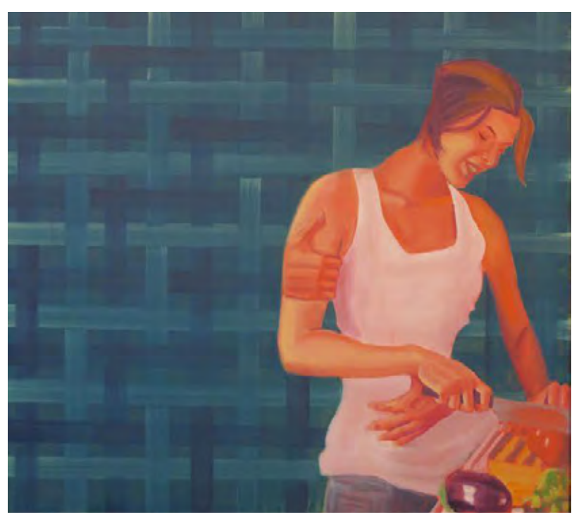
Yitzhak Livneh, 2009.

The second artist is Michal Na'aman, the most prominent artist of cutting, whose early works present an assortment of knifes, penknives, as well as cuts that generate impossible combinations. In one of her works from the nineties, she draws the outline of a shaving knife at the very center. She then draws the image of the Wolf Man's dream, as it was painted by Freud's famous patient into the outline of the shaving knife. Without dwelling on every detail of this complex painting, the detail that relates to our concern is the dual use Na'aman makes of the image of the knife: the one that appears in the painting as an image, and the one that cuts the frame and which reflects the scene of the tree with the wolves. That is, Na'aman shows how the cut of the frame and the cut of the knife are of the same order, while both are immanent to painting.