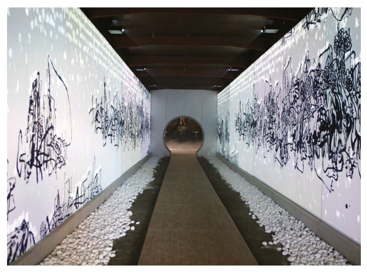
8. Pan Gongkai. Snow melting in lotus. China Pavillon. Venice Art Biennale 2011.

When visitors reach the main aisle of the cistern, they can see the installation Snow Melting into the Lotus created by Pan Gongkai. Pan is both an ink and water painter and conceptual artist, who has experienced and then more deeply explored the contradictions between the traditional and the contemporary, Chinese and Western culture, which according to Pan's interpretation, can both co-exist and be "harmonious in difference." When visitors go through the installation, they experience the pleasantly cool smell of lotus (fig. 8).