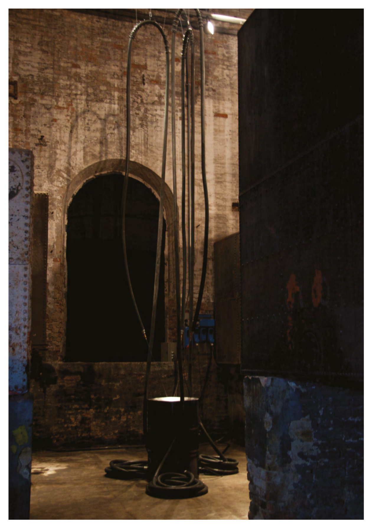
5. Liang Yuanwei. I Plea: Rain. China Pavillon. Venice Art Biennale 2011.