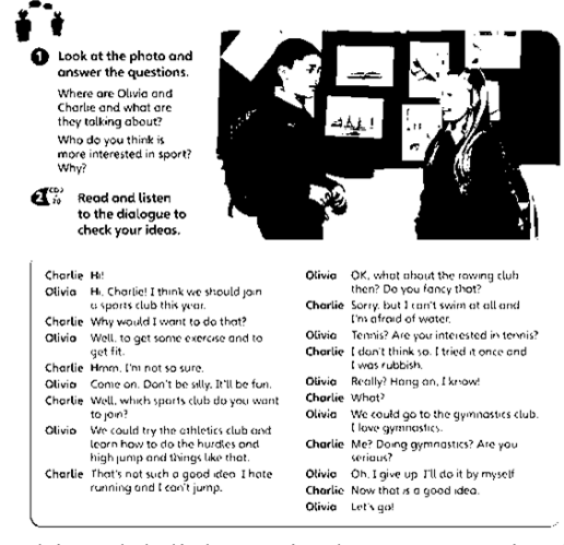
Figure 3. Excerpt of the multimodal dialogue in the 'communication' material (Puchta et al., 2017)

The present study was aimed at investigating the interpersonal meaning in a multimodal dialogue of an EFL textbook for a primary school level. The multimodal text in the form of a dialogue is represented in Figure 3. The dialogue was accompanied by a photo depicting two students named Charlie and Olivia. They were discussing a particular topic, i.e. 'joining sport club'. To construe this multimodal text, the inspection was conducted by going through the visual meanings followed by verbal meanings and intersemiotic complementarity, respectively.