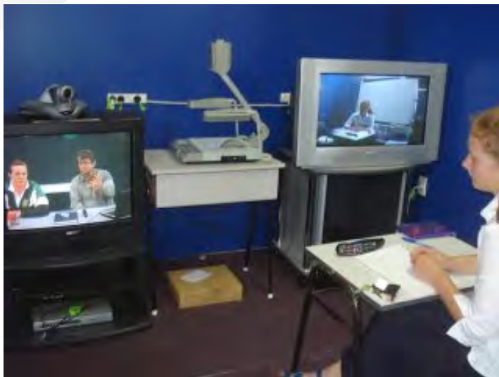
Figure 1 Dedicated video-conferencing system

Dedicated video-conferencing systems usually comprise a video camera and CODEC device for recording, compressing, and sending video and audio data across a network; two television monitors (one to view the local site and another to view connecting sites); and an audio unit and controlling device (Mason, 1994).