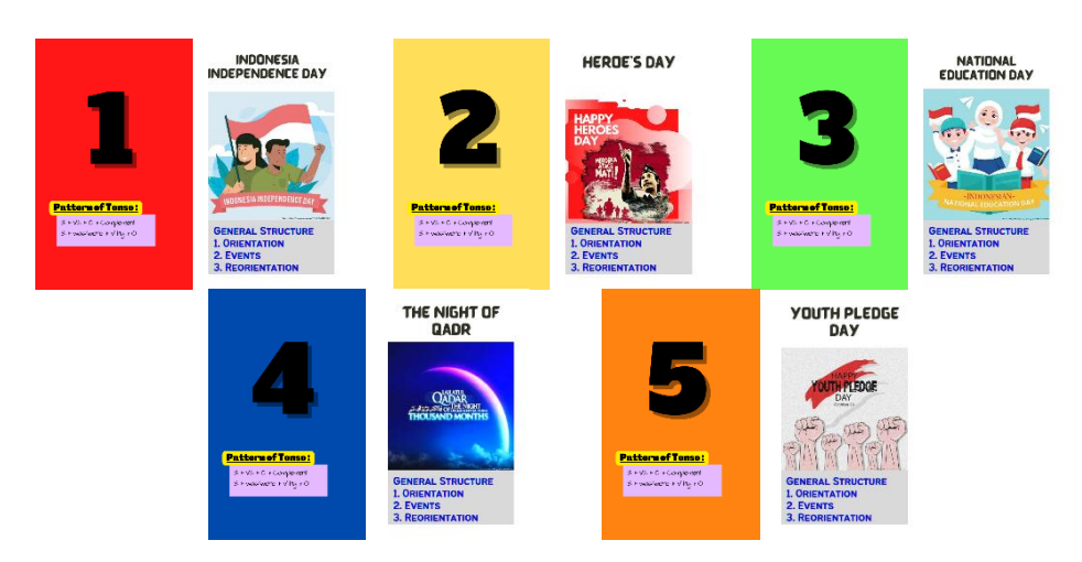
Figure 3. The Product of Flashcards Media

This process aims to produce development media products in the form of flashcards for learning grammar. The first stage in the product development process is to see from the results of the analysis of student needs regarding what students need for learning. The manufacture and development of this product are adjusted to the material in semester 1 of tenth grade for IIK 2 at MA Bustanul Muta'allimin. After knowing what products are used following the results of students' needs for learning, the researcher carried out the initial stage utilizing media design. These flashcard media are in the form of picture cards where the front side of the card is a lottery number to choose a theme and each front side of the card has various colors. In addition, there are sentence patterns or grammatical tenses that are used in the preparation of simple sentences using historical recount text. On the back side of the card, there is a theme that will be written by students according to the historical recount text material. After the product design was completed, the researcher printed the flashcards media so that they became cards that were sized like ID Card. Flashcard product results can be seen in figure 3.