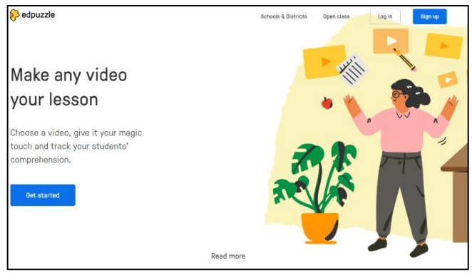
Figure 1: Interactive Media EdPuzzle

As technology develops, teaching media also develops into a combination of audio, visual, text, and animation. Images, text, sound, video, and animation are components of multimedia that are widely used by interactive media, one of which is interactive media Edpuzzle (Mishra & Sharma, 2011). Teachers can select videos and customize them based on class needs by entering question types such as multiple-choice questions, audio tracks, audio notes, or comments on videos whose purpose is centered on assessment in the EdPuzzle application (Prawati in Ipek & Ustunbas, 2021). The advantages of interactive media EdPuzzle (www.edpuzzle.com) are that it can enhance the distance learning experience, convince instructors that learning is happening, because students can take quizzes throughout the video, instructors can measure coursework, add audio notes, and can share videos with others (Abou Afach, Kiwan, & Semaan, 2018). While the lack of interactive media EdPuzzle, teachers cannot provide feedback openly on which answers are right or wrong. Teachers can only give suggestions or reasons why students' answers are wrong or right, but they can only make sure that the answers are wrong or right.