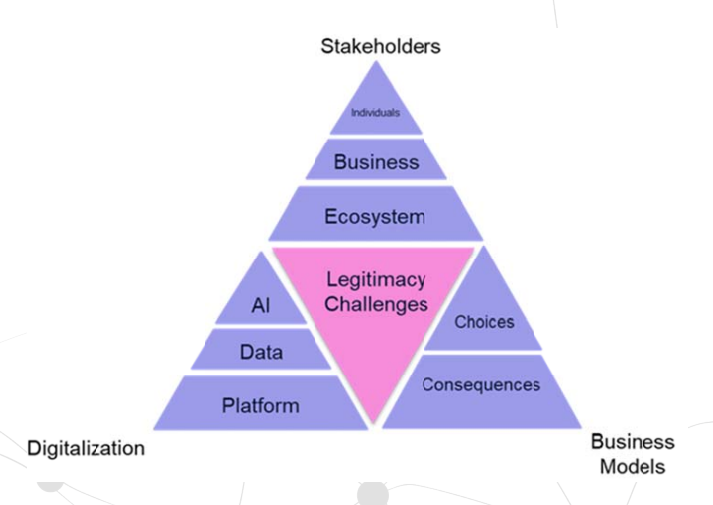
Figure 1: The approach to researching legitimacy challenges in the digitalization context.

Digitalisation allows the emergence of novel ecosystemic business models by combining an increasing number of IoT sensors, vast amounts of data, and more efficient, effective, and comprehensive AI or machine learning (Ricart, 2020). AI applications should not be considered in isolation as a mere technological infrastructure (Zamora, 2020) but coupled with data and the platform (Figure 1), because connected data constitute both the input and output for the AI algorithms. In such a configuration, the platform functions as a tool to "extract and harness immense amounts of data that allow them to operate as critical intermediaries and market makers" (Rahman and Thelen, 2019, p. 178). The data collected