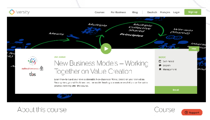
Figure 1: Screenshot landing page MOOC