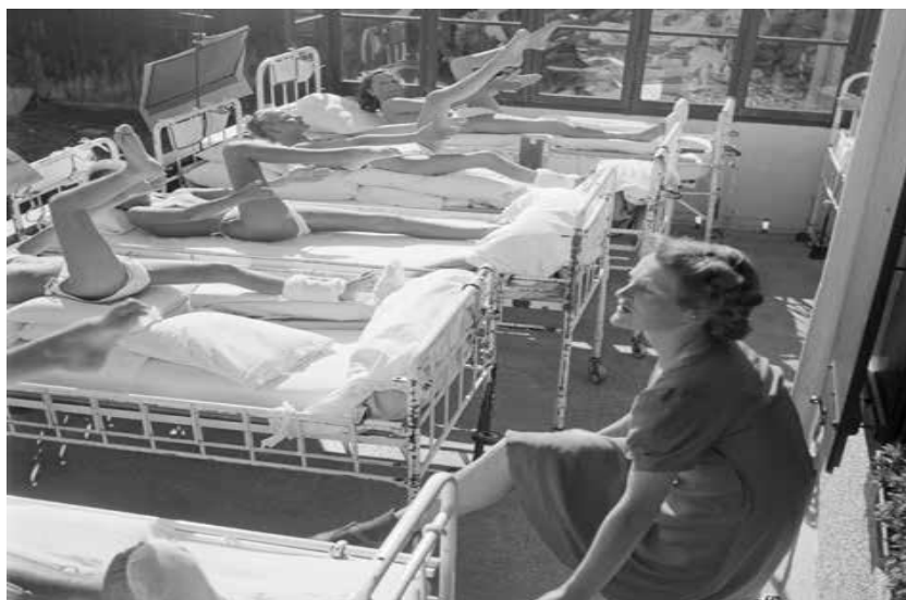
Figure 1. children basked in Sanatorium

The first sanatorium was opened in 1903 by Dr. Auguste Rollier (1874–1954) in the city of Leysin, in the Swiss Alps and a major supporter of sunlight therapy with Dr. Danish Niels Finsen (1860-1906). The first sanatorium was dedicated to caring for TB children and immediately began bringing TB patients from Europe ( Greenhalgh, 2017 ).