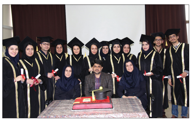
Figure 4: Graduation celebration ceremony

booth's design. In the end, the efforts of the members of the executive team were also appreciated.