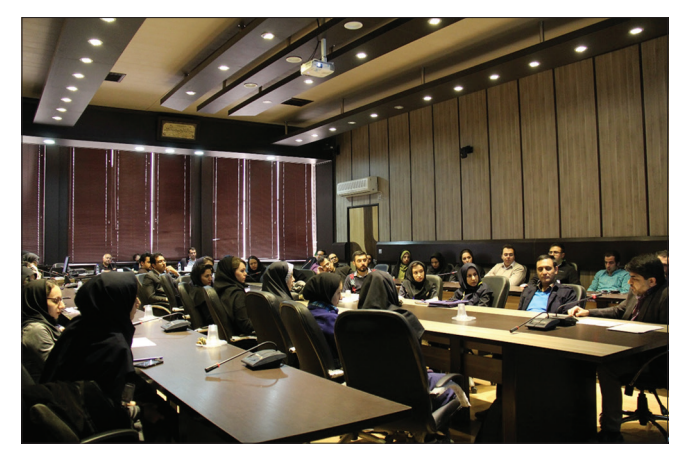
Figure 1: Panel discussion on "immigration and brain drain"