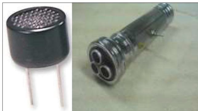
Figure 1: Shape of SQ-40T transducer (left) and an array of air ultrasonic ceramic transducer (right)

All the animal procedures were performed in accordance with the protocols approved by Ethical Committee of Urmia University of Medical Sciences in the use of lab