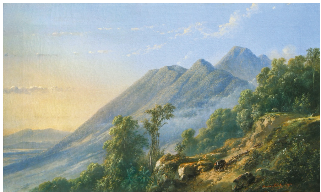
Figure 4. Megamendung Pass by Raden Saleh Syarif Bustaman (c. 1811–1880), 1862, oil on canvas, 90 x 53 cm. Private Collection Indonesia.

Daendels's great trans-Java post road ( postweg ) was built (1809–1810): "no governor had thought of it before him, and I believe none will dare to contemplate it afterwards" (" aucun gouverneur n'y avoit pensé avant lui et je crois qu'aucun n'auroit osé penser après ") was the Belgian officer, Major Éduard Errembault de Dudzeele's (1789–1830), pithy summation of the project's sheer scale when he travelled the road during the Java War (1825–1830) (Carey 2021, 36 n. 10).