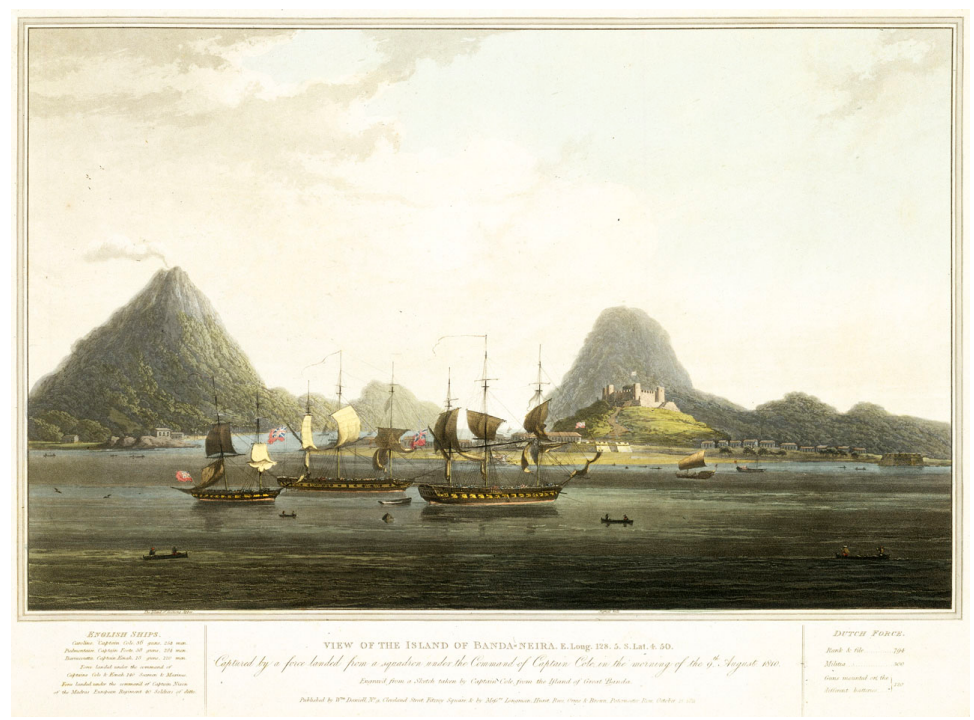
Figure 1. 'View of the Island of Banda Neira Captured by a force landed from a squadron under the command of Captain [Christopher] Cole on the morning of 9<sup>th</sup> August 1810' (Lithograph by Longman, Hurst, Rees & Brown, 16 October 1811), aquatint 43 x 58 cm.

After Rainier's departure in 1805, and his replacement first by Nelson's line captain, Rear-Admiral Sir Thomas Troubridge (1760–1807; in post, 1805–1807), and then by Troubridge's deputy, Rear-Admiral Sir Edward Pellew (post-1816, Lord Exmouth, 1757–1833; in post 1804–1809), the situation in Java became a strategic priority for Britain. During the three and a half years of Marshal Herman Willem Daendels' administration (1808–1811), when the island was fortified as a French military base in the Indian Ocean, Britain's position in India and its control of her maritime trade routes to China via the Melaka Straits began to come under threat. It was for this reason that the Governor-General of Bengal, Lord Minto (in office, 1807–1813), was instructed in 1809 by the British Government and the British East India Company (EIC) Directors to eject the French from all their posts and fortified strongpoints in the Indian Ocean, including Réunion (Île de Bourbon), Mauritius (Île de France), and Java. These were all captured by British amphibious operations—namely, a combination of British naval power (Figure 2) and Indian and British army expeditionary troops (Figure 3)—in 1809, 1810, and 1811 respectively.