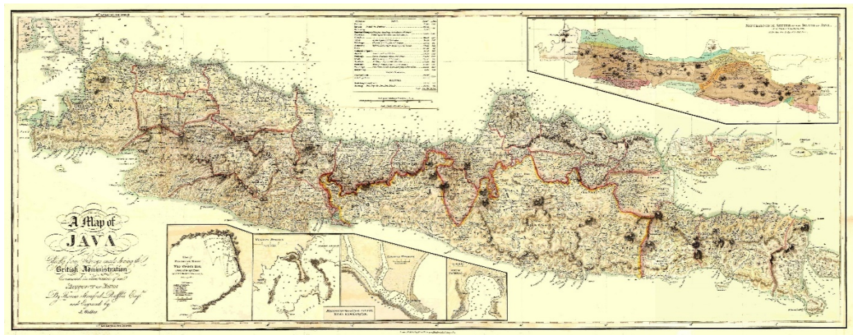
Figure 5.John Walker's (1759–1830) map of Java published in Raffles History of Java (1817). The most detailed every produced up to that point in time, it showed all the mineral and natural resources of Java as well as landing places on the south coast—in particular Pelabuhan Ratu (Wijnkoops Bay), Cilacap and Pacitan—where amphibious forces could be disembarked in the event that the British had to reconquer Java from the Dutch following the end of the Napoleonic Wars in 1815.

Over time the grote postweg became one prolonged urbanized area. Java along with the 400-kilometre arc of the Kantō plain between Osaka and Tokyo in Japan, developed into one of the most densely populated regions in the world. In Nas and Pratiwo's words, 'one could call Java the longest city in the world with the grote postweg as its main transport and economic artery' (Nas and Pratiwo 2002, 721). While what remains today of the postweg is almost obliterated by Java's urban sprawl, it did not start out that way. In fact, the use of the new trans-Java highway was heavily restricted at least until 1857. Only then was it opened to general traffic. Not only was it a military road, but it was also a posting road built for the fast delivery of government dispatches and European personnel. Anyone using it needed official permission (Kraus and Vogelsang 2012, 98). Indeed, the road was not accessible to Javanese vehicles which had to use special carting roads that ran alongside the postweg . Until 1857, it was only for Dutch carriages equipped with the requisite coachmen and footmen. In Kraus's words, "when a colonial officer travelled along this road in an official capacity, it was more than just a journey it was a demonstration of colonial power" (Kraus and Vogelsang 2012, 69). Such impressions were also evidenced in Major Errembault's Java War diary and by non-Dutch witnesses writing in the mid-nineteenth century (Carey 2021, 41).