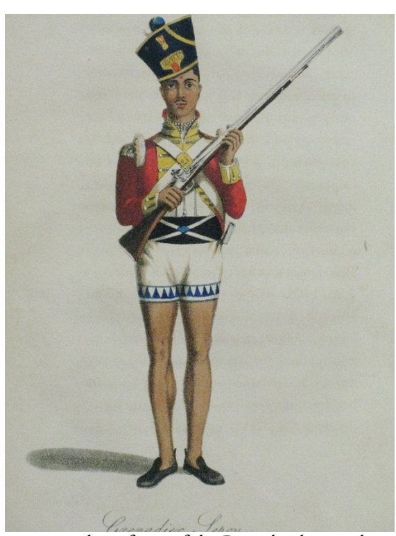
Figure 3. A grenadier sepoy, a member of one of the Bengal volunteer battalions which took part in the British invasion of Java in August-September 1811 and the subsequent attack on Yogyakarta, 20 June 1812. Aquatint by William Daniell (1769–1837) from John Williams, An historical account of the rise and progress of the Bengal native infantry from its first formation in 1757 to 1796 (London: John Murray, 1817), p. 171 facing.