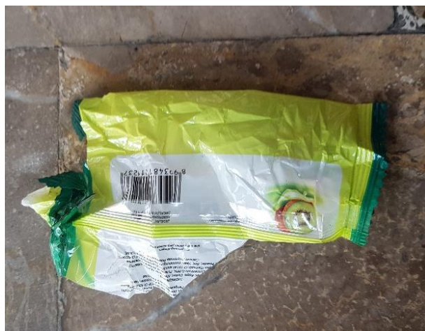
Fig. 2. OPP (oriented polypropylene plastic)