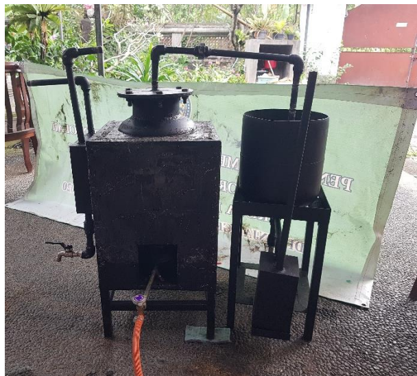
Fig. 1. Pyrolysis device

glass wool has the same design, but it is not covered with glass wool. After completion of the device design process, 500 grams of OPP plastic is inserted into the pyrolysis reactor, which will experience a heating process when the burner is turned on with a fuel source of 3 kg LPG gas, and a process of change of state in the reactor from solid to gas occurs. The condenser tube has previously been filled with water as a cooling medium, which is called the liquification process, which is the process of changing the form of gas to liquid. In this condensation stage, a distillation process occurs to produce pure pyrolysis oil. The temperature of the cooling water in the condenser was found to be 28°C. The pyrolysis process was carried out within 1 hour of each test, with a reactor temperature of 200°C. After the testing process is complete, the results of the weight of the pyrolysis oil are compared to the reactor variations equipped with glass wool and without glass wool.