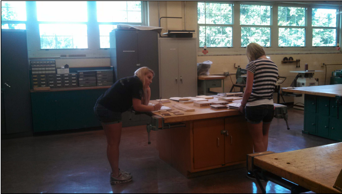
Figure 3: Students in the lab with foam models and wood.