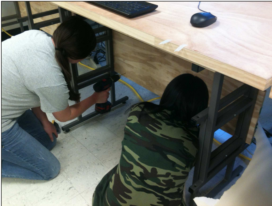
Figure 4: Students in lab (studio) installing tables they made.