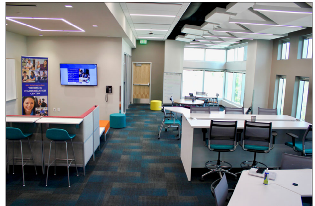
Main Studio Space - Highlighting Furniture