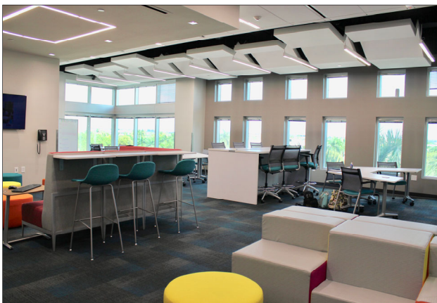
Main Studio Space - Highlighting Windows