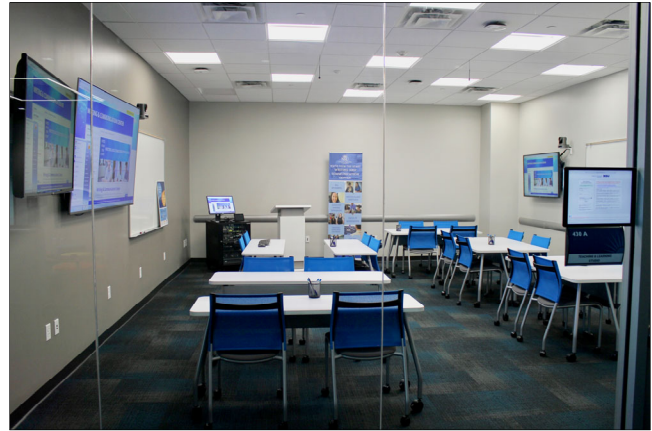
Teaching and Learning Studio