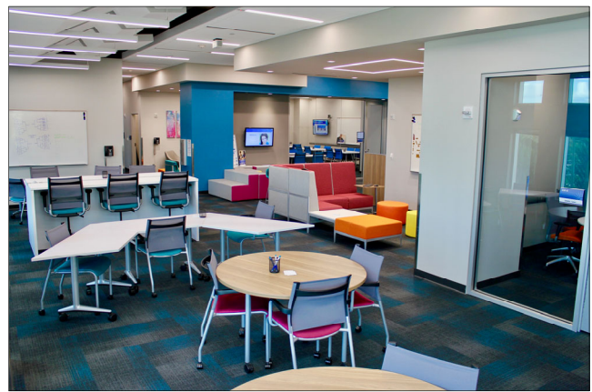
Main Studio Space - Longview, Colors