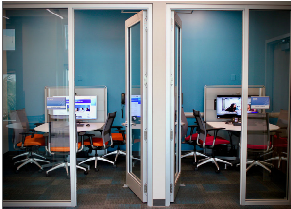
Shark Tanks I and II