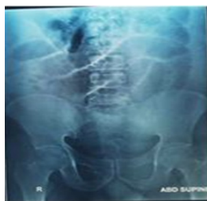
Fig. 1: Plain X-ray abdomen: Supine: Showing distended bowel loops.

Intraoperatively, a hard phytobezoar was found approximately 8cm proximal to the ileocecal junction with dilated proximal and collapsed distal ileum. No adhesions at the site of obstruction or stricture were seen. Around 300ml of reactive fluid was present in the peritoneal cavity. Enterotomy with removal of the bezoar was done followed by decompression and closure of enterotomy. Postoperatively, the patient was kept in elective ventilation. But on the fifth post-operative day, due to ongoing sepsis and exacerbation of co-morbid chest condition she developed type II respiratory failure.