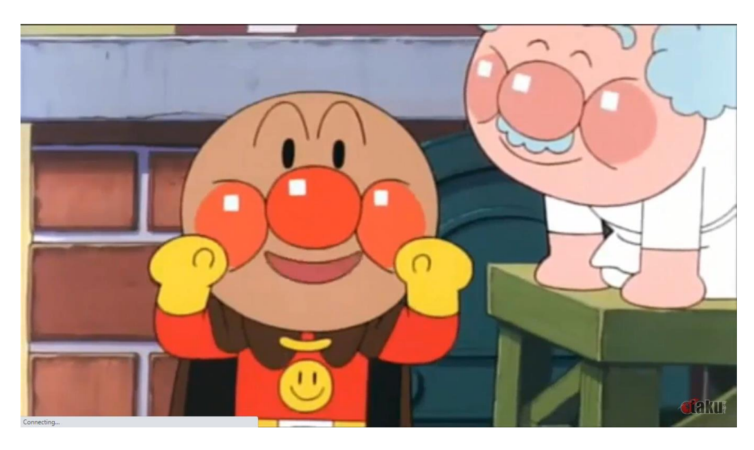
Figure 4. Anpanman in the film Soreike! Anpanman Kira Kira Hoshi no Namida

In 2005, Takashi Yanase park was built near Kochi Museum. Following this, Anpanman children's museums were built in Nagoya, Sendai, Kobe and Fukuoka. In 2016, Anpanman's birthday, known as "Anpanman no Hi (Anpanman Day)" on 3 October was launched. Up to the present time, Anpanman continues to be everybody's superhero, not only in Japan, spreading the words of "Ai to Yuuki (Love and Courage)" to the world. On the first edition of the comic book, Yanase wrote: