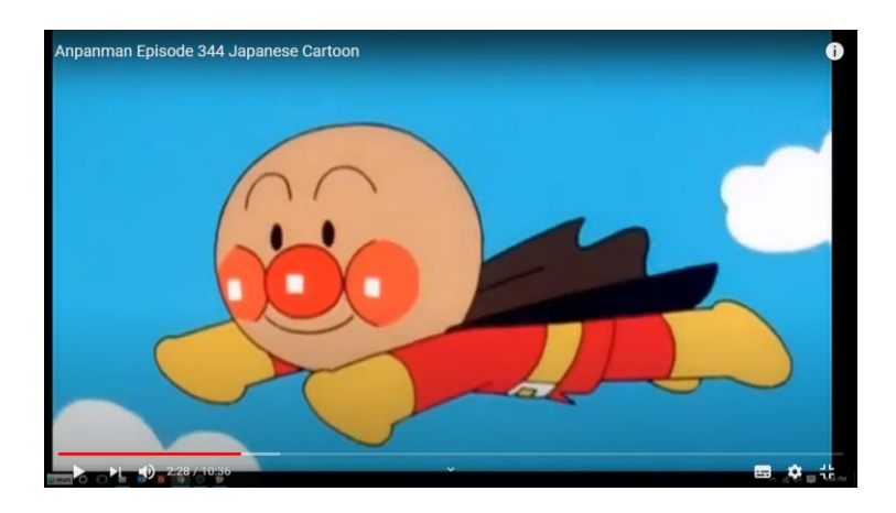
Figure 3. Anpanman in one episode of the Sore Ike! Anpanman cartoon series

The film was first screened in 1989 with the title Soreike! Anpanman Kira Hoshi no Namida.