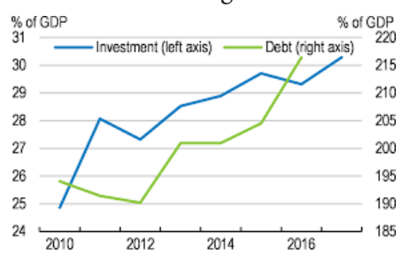
Figure 1. Turkey's economic growth