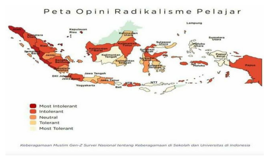
figure.5 PPIM Syarif Hidayatullah State Islamic University Jakarta

such as Telegram, WhatsApp, etc. facilitate them to communicate local extremist groups or gain more supporters for their goal.