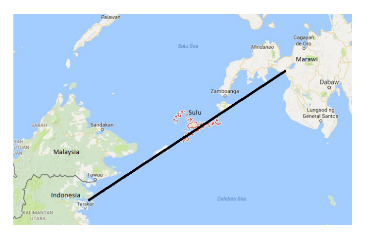
Figure 4 The Sulu Sea between Malaysia, Indonesia, and Marawi (Philippines)

Indonesia, Philippines, and Malaysia deployed a warship to reconnaissance patrol the waters plagued by this threat, signaling the start of unheard-of joint patrols by the countries that share borders in the region. There is a sense of urgency in the joint patrols following the alarming collapse of security in the southern Philippines after ISISlinked fighters, including some from Indonesia and Malaysia, overran the city of Marawi. Malaysian Defence Minister Dato said, "I expected other Southeast Asian countries to participate in more joint patrols in the future to ensure security and safe travel throughout the region." Extremist groups are connected, and terrorism has become transitional, the national police of the Philippines reported