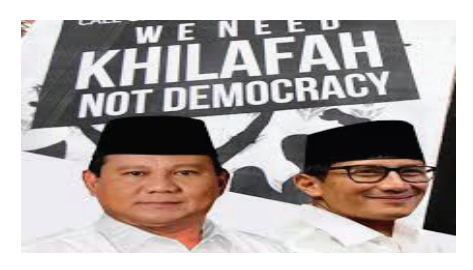
Figure 6. The Prabowo-Sandi meme with the caliphate

on religious radicalism reached its peak in the last ten years in 2016 when the masses gathered in Jakarta to take action against charges related to the alleged blasphemy case. Moreover, the discourse of religion and nationalism is often used as a propaganda tool for winning in every Pilkada and Presidential Election.