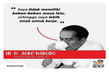
Figure 5. Meme Jokowi without the burden of the past

writings that Jokowi is the leader of the people without the burden of the past and not the burden of the future, it means that other parties are trying to become leaders but have or are considered to have burdens from the past and are also a burden for the future. This concept statement will not be issued if there are no other symptoms or discourses that develop about parties who have had burdens in the past and are trying to keep advancing in the 2019 presidential election.