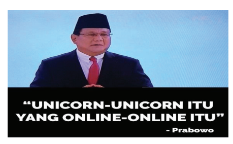
Figure 10. Prabowo's meme talking about unicorns

The meme in picture 9 shows a brown background with an illustration of Prabowo speaking using a loudspeaker on a podium. In this picture, Prabowo Subianto asserts something with his index Complementing finger. illustration is the inscription or text "'If We Lose Indonesia Will Be Extinct." In detail, in writing, the word "Indonesia" is colored in red while the other words are in black. Every color has its meaning. Black means sorrow, emptiness, and mystery. Meanwhile, red means courage, adrenaline, passion, and strength. Nevertheless, on the other hand, it also means passion and lust. This meme shows that if Prabowo Subjanto loses, then Indonesia will face the threat of extinction.