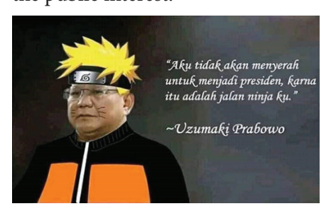
Figure 8. Meme Prabowo as Naruto

In the seventh meme, the picture shows Prabowo Subianto standing behind the podium while raising his right hand. Prabowo Subianto wore a short-sleeved shirt and a skullcap. The second photo shows Prabowo Subianto pointing forward with his left hand and without a skullcap, as seen in the first picture or other photos. In addition to the two photos combined in one frame, there is also a caption or writing, "Often Insulting the Poor." This picture shows a Prabowo Subianto who likes or often insults the poor with very light body or hand gestures to point at or be directed at people with economic conditions at the lower level. In other words, Prabowo Subianto does not empathize and does not accommodate the interests of the poor who have become part of the public interest.