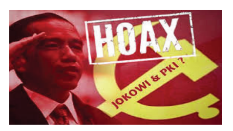
Figure 2. Jokowi and PKI memes

to show that Joko Widodo is indeed a member of the PKI.