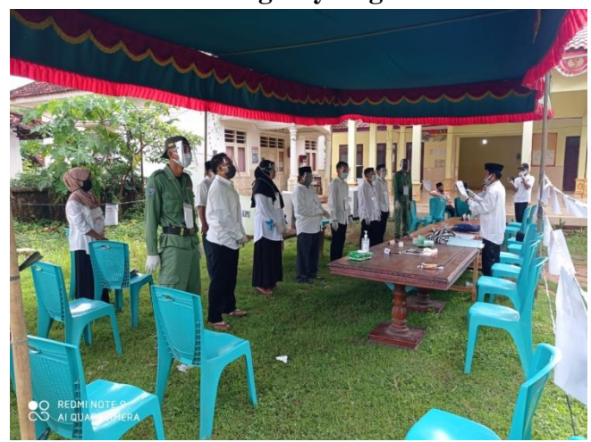
Photo 1. Polling Station (TPS) 06, Gapura Barat Village, Gapura District, Elections to Regency Regions