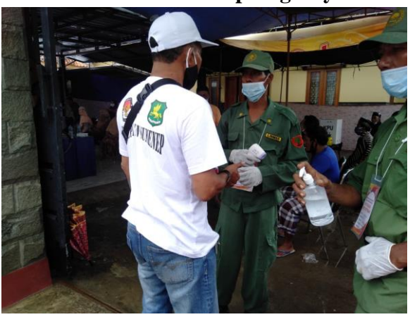
Photo 2. Polling Station (TPS) 01, Bungbungan Village, Bluto District, Sumenep Regency