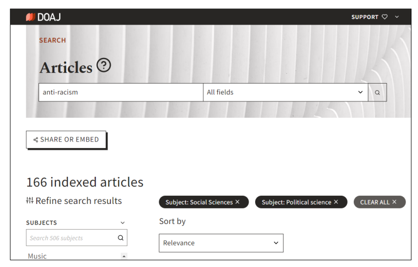
Fig.1 The result of literature categorization in the DOAJ database

(DOAJ) articles were used as a student-friendly-reputable-publication database. The author uses the category of 'social sciences' and 'political sciences' to find the discourse on anti-racism among academicians, as shown in Figure 1.