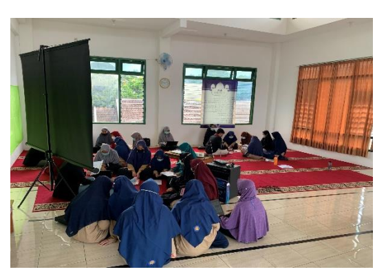
Fig. 2. FGD in SMA Aisyiyah Boarding School 2021

This research analysis was based on the literature review from online-based research publications, especially from reputable scientific journals. It used the interpretive method of research analysis. Data collection used 'challenges of nationalism in the digital era' as the keywords were published in 2018.