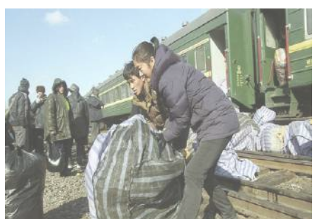
Figure 1. Russia and China are connected with the train line through Suifenhe.

Also, citizens who returned from abroad to China, such as Chinese people who wanted to return to their country from Russia, had to be tightened by imposing a quarantine rule for 28 days for those who came from abroad and those who returned from abroad. It was mandatory to undergo an antibody test (BBC World, 2020). The increase in cases prompted the Chinese consulate office in Vladivostok to appeal to Chinese citizens not to use the Moscow-Vladivostok-Suifenhe route.