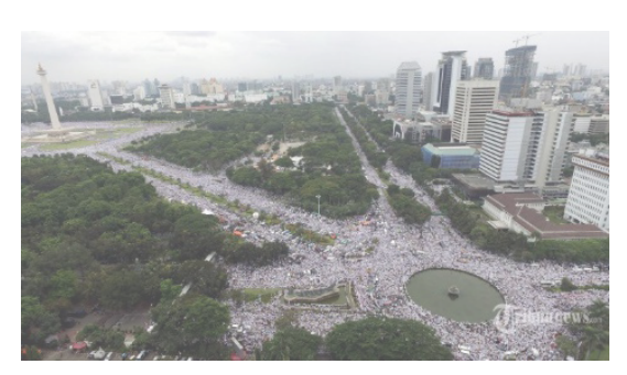
Figure 1. Display of Participants in the Defend Islam Action December 2, 2016 (https://bangka.tribunnews.com/2016/12/04/mengharukan-inilah-kisah-pengalaman-wartawati-non-muslim-saat-liput-aksi-damai-212)

The Islamic Defense Actions (IDA) commanded by the Islamic Defenders Front (FPI). symbolize the protest, they created unique numbers for the taglines, such as 1410, 411, 212, 112, 212 (Reunion), 313, and 55 (Republika: 10.05.2017). Each demonstration activity was focusing on echoing the mass invitation to join the IDA. It took place on December 2, 2016, which became 212, at the National Monument (Monas). The "212" demonstration caused traumatic effects related to the 1998 riots on the Indonesian community (BBC Indonesia: 01.12.2016). This activity also received attention from various parties because of President Jokowi, who previously was unable to accept representatives of 411 and 212 demonstrators (BBC Indonesia: 02.12.2016).