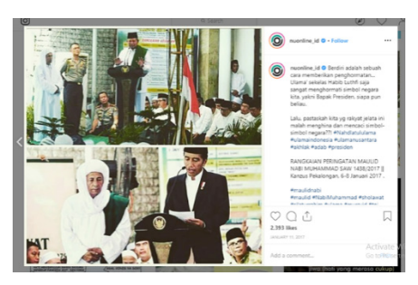
Figure 5. A form of persuasion message shown by Nahdlatul Ulama (https://www.instagram.com/p/BP HYFOZD7qX/?igshid=135dq3w7p rvgn)