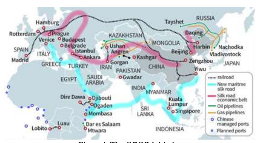
Figure 1: The OBOR initiative

The OBOR initiative is one of the most ambitious infrastructural projects ever conceived in the field of logistics (for a synthesis, see the contributions collected in Lim, Chan, Tseng & Lim [2016]). It was announced by President Xi Jinping during official visits to Kazakhstan and Indonesia in September 2013. The initiative itself has two complementary components, so in fact two major "roads" rather than one: a land component on the one hand, and a maritime component on the other (see Figure 1). The implementation of the "New Silk Roads" is based on the creation of an extensive network of railways, pipelines and highways, and the acquisition of ports, both to the West, through the former Soviet republics and Europe, and to the South, namely Pakistan, India and the rest of South-East Asia. In addition to transport infrastructures, China is planning to establish about 50 special economic zones, based on the Shenzhen Zone model launched in 1980. In fact, the OBOR initiative is contributing to the implementation of a strategy to extend its growth model to other partner countries in order to develop trade with them, a source of new contracts for China. To achieve this, an ambitious logistical policy is essential, which corresponds to a constant desire to improve supply chain performance as a source of competitive advantage (Tuerxun, 2017).