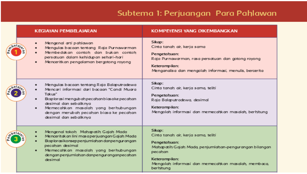
Figure 3.2 Learning Activities and Competencies Developed in Subtema 1 The Struggle of Heroes at Lesson 3

Figure 3.2 can support the explanation that the learning activity should only contain solving the problem of addition and subtraction of decimal fractions. While in the process there is the activity of converting ordinary fractions into decimal fractions and sequencing pecaha. Afterwards the new students do the counting in the addition and subtraction operations.