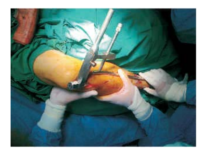
Figure 4- Insertion of the nail into the medullary cavity of tibia over the guide wire