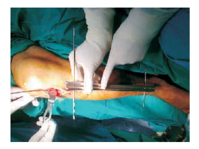
Figure 2- Measurement of the length of the nail and the site of holes