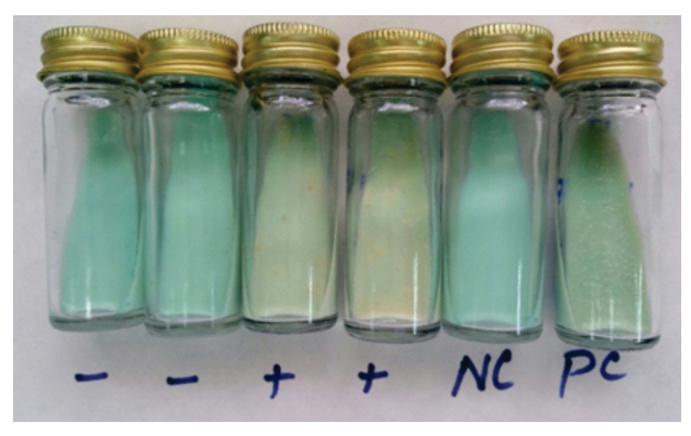
Fig. 3: Mycobacterium Growth on LJ Culture Medium. From Left to Right 1<sup>st</sup> and 2<sup>nd</sup> Slants are Negative for MTB, 3<sup>rd</sup> and 4<sup>th</sup> Slants are Positive for MTB, 5<sup>th</sup> Slant is Negative Control (NC) and 6<sup>th</sup> Slant is Positive Control (PC) for MTB

The results of LJ culture showed 43(68%) out of 63 cases were positive in BAL specimen whereas 16(43%) out of 37 cases were positive in sputum specimens (Figure-3).