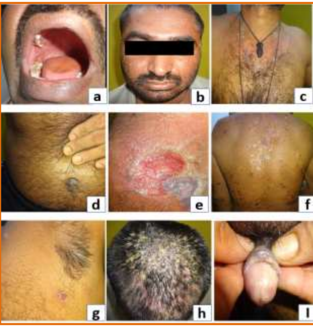
Figure 1: Showing (a) ulcerative lesions present on the buccal mucosa (b) multiple vesicular lesions present on the face (c) multiple vesicular lesions with erosion present on the lower neck (d) multiple vesicular lesions present on the umbilicus (e) multiple vesicular lesions with erosion present on the upper limb (f) multiple vesicular lesions with erosion present on the back (g) multiple vesicular lesions with erosion on the axilla (h) flaccid blister lesions on the scalp (i) multiple vesicular lesions present on the dorsum of the penis.

A 39-year-old male patient who lives in Surat, Gujarat, was referred with a 3-month history of painful ulcerated lesions in the oral cavity. On enquiring about the patient's history, we came to know that initially, the patient had difficulty chewing food and the severity increased gradually. The ulcerations caused considerable discomfort, affecting his normal oral functions. Subsequently, fluid-filled lesions developed involving the scalp, trunk, limbs, and axilla. Lesions were increasing in size and number and had little tendency to heal. Blisters were flaccid and burst on their own to form erosions within 2-3 days. Medical and family history was noncontributory. No history of fever, joint pain, malaise, and photosensitivity. He had weak oral hygiene due to the bad habit of taking betel quid with tobacco five times a day and smoking seven bidis per day for the past 12 years. Further, he consumes two-quarters of alcohol on an alternative day for the last 12 years. History of any drug intake before the appearance of lesions was also absent. Intraoral examination revealed that approximately 1.0 × 1.5 dimensions ulceration lesions were present on the buccal mucosa. Dermatological examination revealed multiple vesicular lesions ranging from 0.3 \times 0.3 to 1.5 × 1.5 involving the face, trunk, upper limbs, and dorsum of the penis (Figure 1a-i).