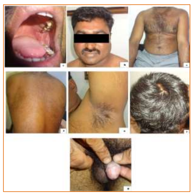
Figure 3: After rituximab therapy, almost complete healing of (a) ulcerative lesions in the mouth (b) vesicular lesions on the face (c) lesions on the lower neck, umbilicus, and upper limb (d) lesions on the back (e) multiple vesicular lesions with erosion on the axilla (f) blister lesions on the scalp (g) vesicular lesions of the dorsum of penis.

The level of Dsg 1 and Dsg 3 was detected by the commercial enzyme-linked immunosorbent assays MESACUP Dsg test 'Dsg 1' and MESACUP Dsg test 'Dsg 3'. The level of Dsg 3 and Dsg 1 was found to be 252.6 \mu /ml and 178.8 \mu /ml, respectively, before treatment, however, it was reduced to 45.89 \mu /ml and 1.76 \mu /ml, respectively, after treatment. Lesions healed with post-inflammatory hyperpigmentation without any scarring and milia formation. The patient was followed up 90 days after the last injection and no future reoccurrence of lesions was observed. All the patient's pictures are belonging to the authors.