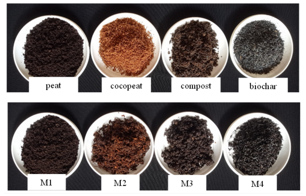
Fig. 2. The growing media, (M1) peat 100%, (M2) peat 70% + cocopeat 30%, (M3) peat 70% + compost 30%, (M4) peat 70% + biochar 30%.