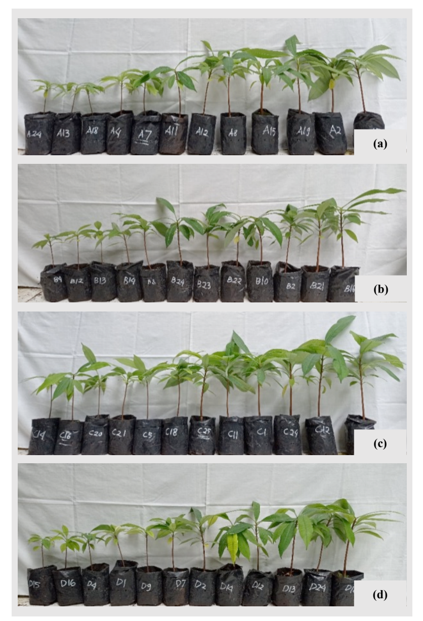
Fig. 3. The Dyera polyphylla seedlings condition of each treatment, (a) seedlings condition of M1 treatment, (b) seedlings condition of M2 treatment, (c) seedlings condition of M3 treatment, (d) seedlings condition of M4 treatment.

In contrast, S. balangeran seedlings showed the best growth performance on M1 media. S. balangeran , which was planted using M1 media, showed the best growth in diameter, TDM, SRR, root length, and DQI, as well as the second-best height growth value compared to other seed-growing media. Peat media (M1) has the lowest N, P, K, Ca, and Mg nutrient content characteristics among other growing media ( Table 2 ), as well as base saturation, ash content, and pH. Seedlings planted on peat media (M1) had the lowest N, P, and K nutrient content and the second lowest C, Ca, and Mg elements compared to others. These results indicate that peat-growing media can better support many growth parameters of S. balangeran seedlings, even though most of the media's nutrient content is low. The growing media that gave the second-best average DQI for S. balangeran was M4 (0.12). Statistically, the results of the DQI of M1 were not significantly different from the DQI of M4. Even so, the average growth of height, TDM, and SRR of S. balangeran grown using M1 were lower than the others. These three parameters are very