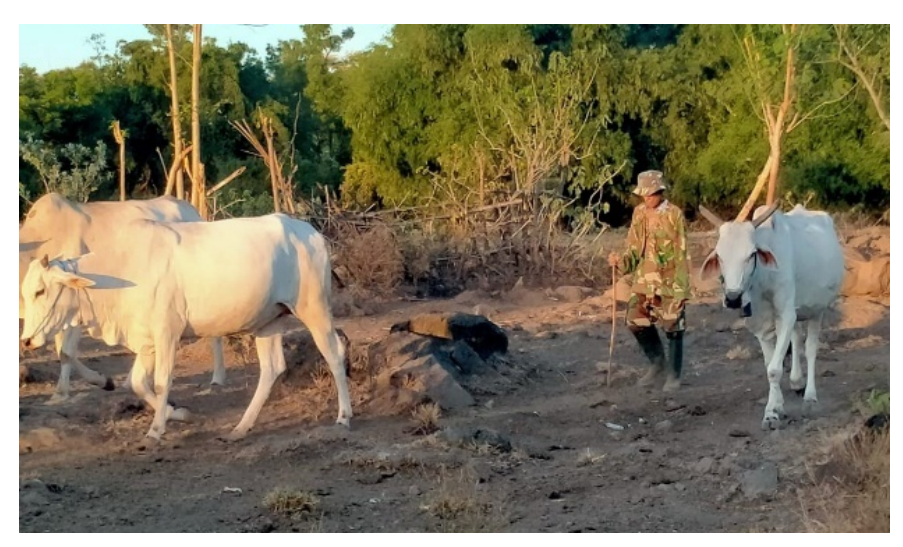
Fig. 2. Wild grazing in Baluran National Park.

The community effort variable is to find out several things related to the level of community readiness, including community awareness, community understanding, and the efforts to reduce wild grazing. The community farmers conduct wild grazing in Baluran National Park is shown in Fig. 2 .