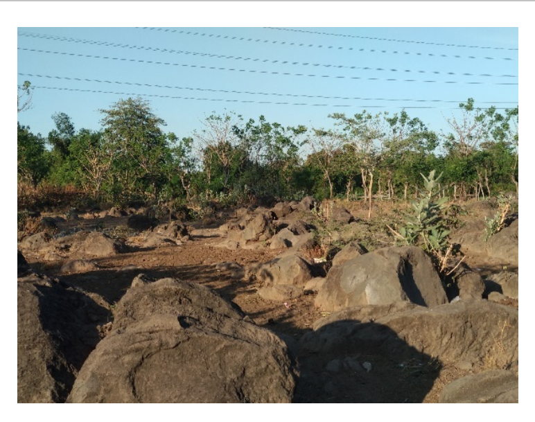
Fig. 3. The entrance to the Baluran National Park area.

BNP management developed other prevention efforts through counseling. Through counseling, farmers are given information about the effects that wild grazing will cause. Yousefpour et al. (2022) reported that revenue-sharing schemes focusing on material benefits and alternative livelihoods might approach the participation communities. Therefore, a persuasive approach is needed to increase the knowledge possessed by farmers. In addition, BNP cooperates formally and informally with several stakeholders to reduce wild grazing. The BNP management recognizes that farmer participation is critical to the program's success. However, Murniati et al. (2022) explained that several schemes to restore conservation had been implemented without involving the community, and the results were not optimal.