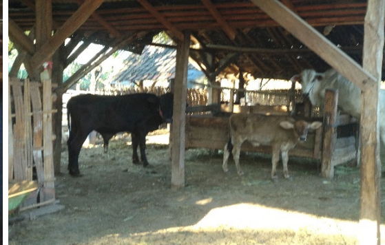
Fig. 4. Cattle in the stall.