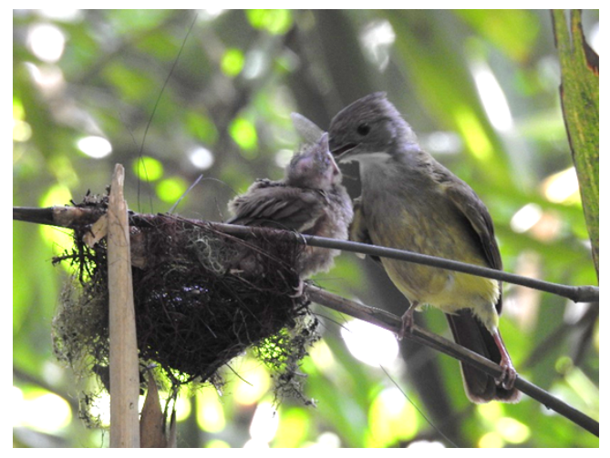
Fig. 3. The mother of the Alophoixus bres gives food in the form of insects to her nestling.