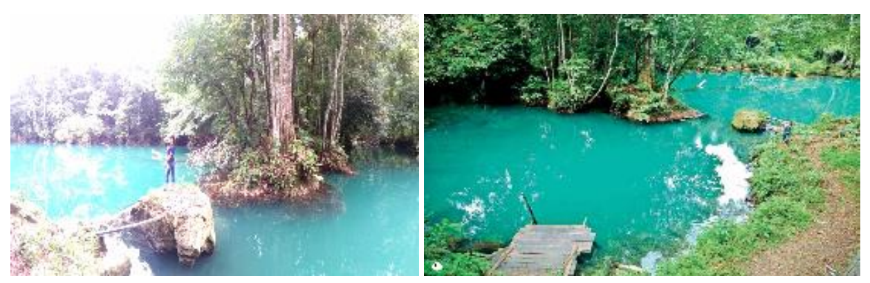
Fig. 2. Nya'deng Lake shows blue water surrounded by forest in Merabu Village.

The safety element fulfills four sub-elements: no dangerous currents in the lake, free from harmful plant disturbances, free from human interference, and free from disturbing beliefs. The variety of activities around the lake fulfills four sub-elements: canoeing, swimming, education and research, and enjoying the scenery. The peculiarities of the lake environment are flora, fauna, local cultural peculiarities, and historical value. The stability of the water in the lake met the sub-elements, which are: there is no lake water user industry, no reduction in land cover around the lake, rainfall throughout the year because it is a tropical rain forest area, and there is no erosion/landslide in the heavy category.