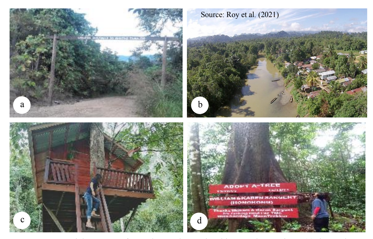
Fig. 3 . Potential supports of Nya'deng Lake tourist objects and attractions: (a) the road to Merabu Village, (b) Lesan River, (c) treehouse, and (d) adopt a tree.

There is a treehouse with two bedrooms that visitors can rent ( Fig. 3c ). Accommodation for the number of rooms within a radius of 15 km. There are homestays or houses in the village that can accommodate several people. There is also lodging that has three rooms managed by Kerima Puri. Kerima Puri is the Village Forest Management Agency which also manages the