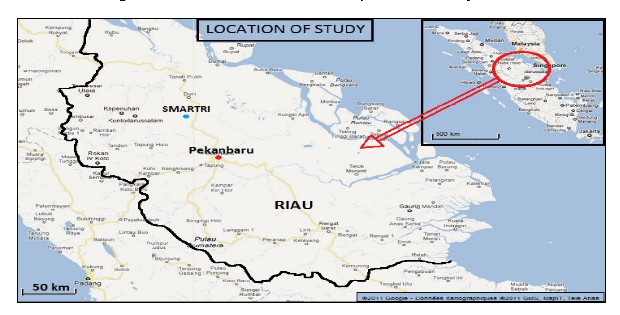
Fig. 1 Location of Study.

can find PIR and KKPA scheme plantations and also independent smallholding plantations. Therefore this region was selected as the location to implement this study.