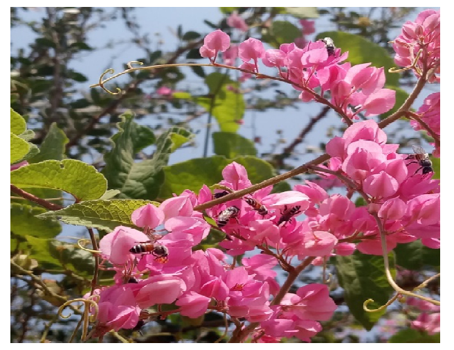
Little bee ( Apis florea )