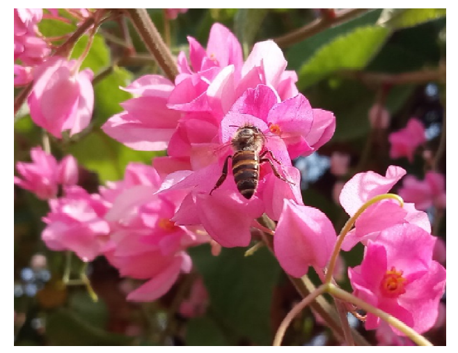
Indian bee (Apis cerana indica)