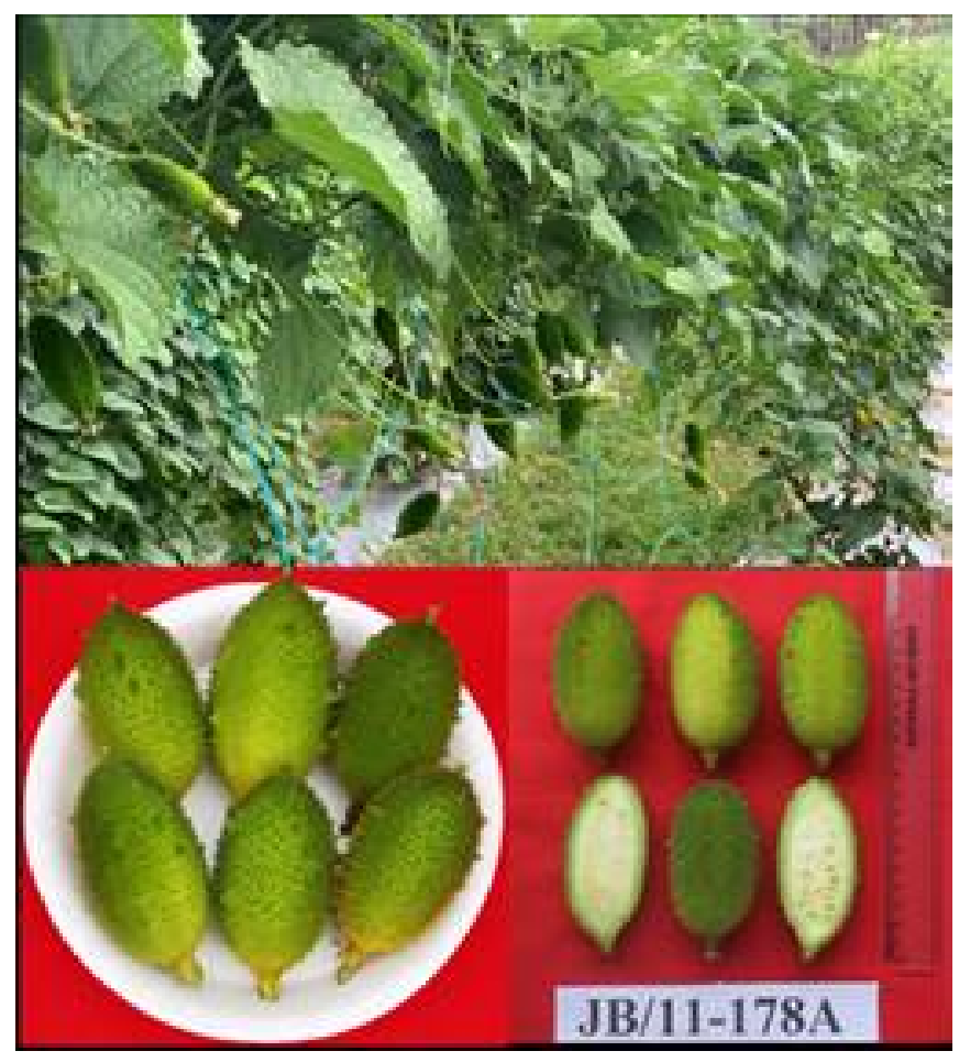
Arka Bharath - New teasel gourd variety