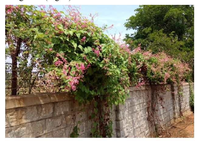
Fig. 1. Antigonon creeper grown on the compound wall of IIHR, Bengaluru

Antigonon leptopus can be propagated through seeds as well as semi-hard wood cuttings. The dual reproductive behavior of A. leptopus is considered as an adaptation for successful survival in tropical environments (Raju et al. , 2001). Our experience shows seeds to be a better means of multiplication. The germination rate was fairly high (80-85%). Seeds were sown in pro trays and a month-old seedlings were planted along the boundary wall of the experimental field of ICAR-Indian Institute of Horticultural Research (ICAR-IIHR), Hesaraghatta, Bengaluru (Fig. 1).