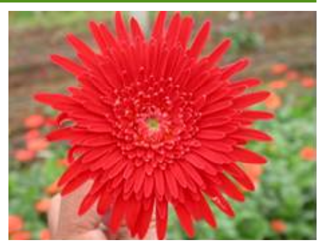
Arka Red - New Gerbera variety