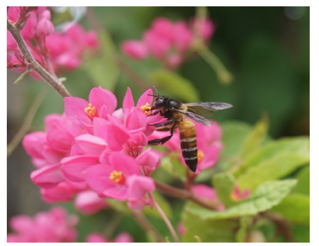
Rock bee (Apis dorsata)