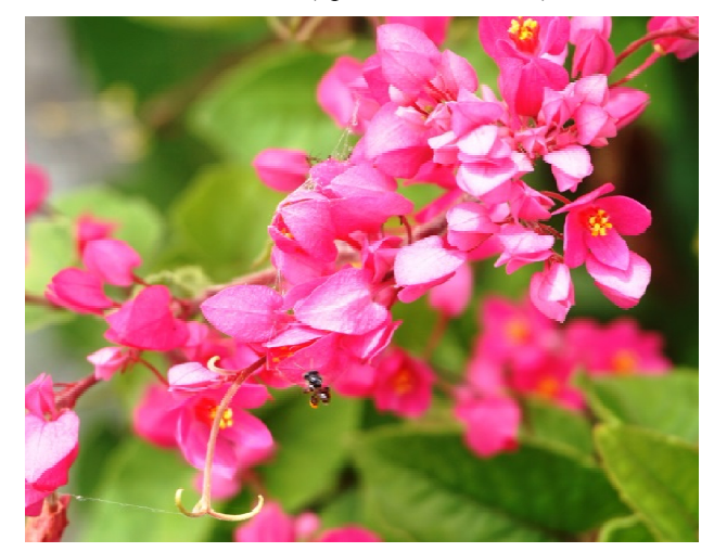
Stingless bee (Tetragonula iridipennis)

Fig 2. Different species of honey bees foraging on Antigonon flowers