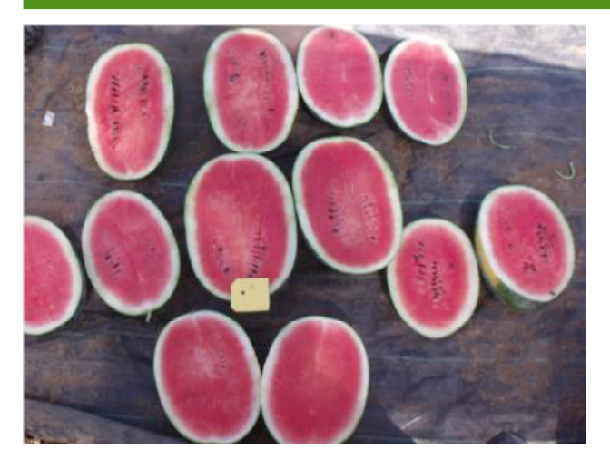
New Water Melon - Arka Shyama variety