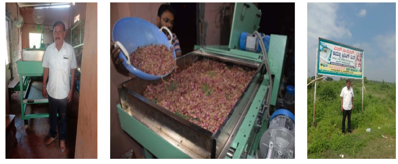
Fig. 4. ICAR-IIHR onion detopping machine installed at Nagamangala as entreprise