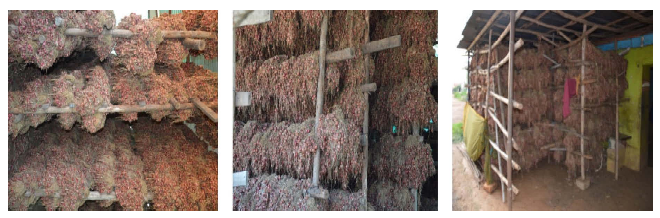
Fig. 3. Multiplier Onion storge

The authors express their heartfelt gratitude to The Director, ICAR-Indian Institute of Horticultural Research, Bengaluru for providing facility and extend his support to carry out this project.