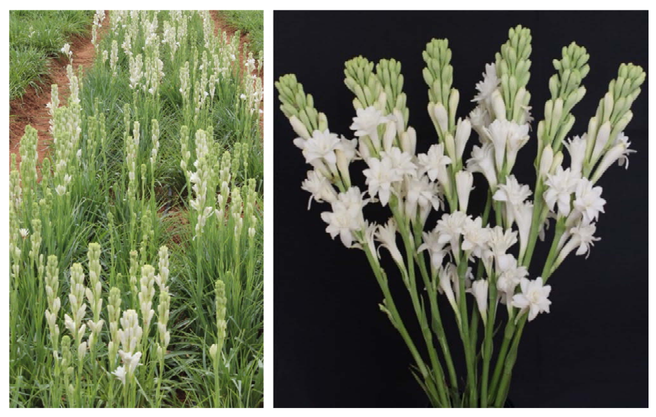
Fig. 1. The field view of tuberose line IIHR-4 and flower spikes