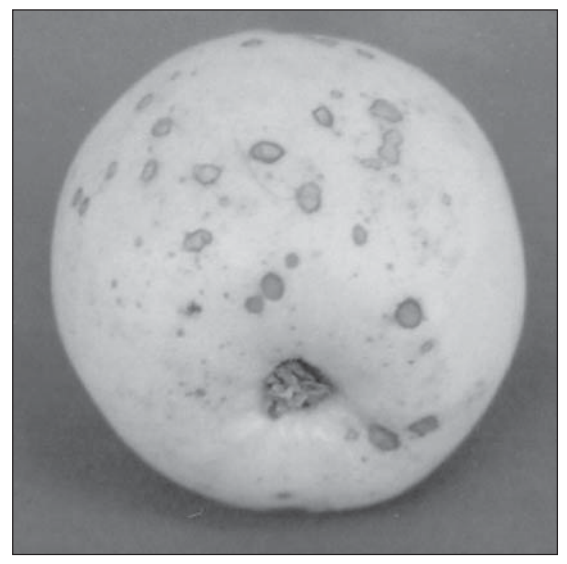
Plate 1. Bitter pit in Golden Delicious apple

films may have may increase VPD leading to higher transpiration and weight-loss. Fruit firmness decreased with increasing number of perforations whereas total soluble solids showed the opposite trend. Decrease in fruit firmness with increased perforation could be the result of enhanced activity of glycolytic and Krebs' cycle enzymes due to an increased level of oxygen in perforated polybags (Parritt et al, 1982; Mir and Beaudry, 2002). Greater water loss from the tissue may also be one of the reasons for decreased fruit firmness through decreased turgor pressure of cells. Increased TSS in better aerated packing may also be attributed to hydrolysis of complex food materials to simpler forms due to aerobic respiration and to concentration of the juice due to dehydration. Similarly, titrable acidity also differed significantly in 'Golden Delicious' apples but did not show marked variation in 'Red Delicious' with perforated polymeric films packing.