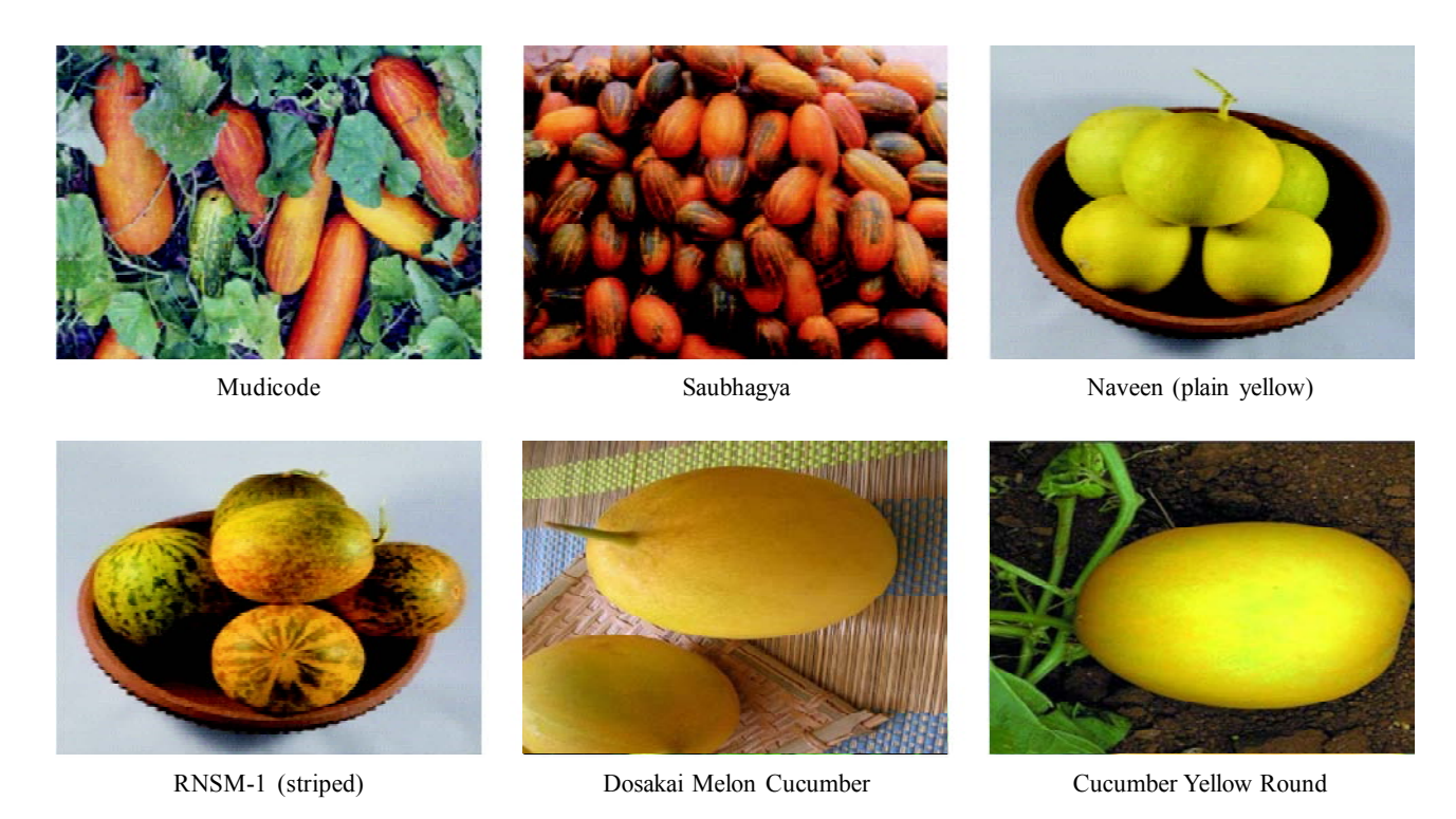
Plate 3: High yield varieties of culinary melon

A high yielding varieties of sambar cucumber variety grown in Telangana conditions. The fruits are not bitter and in general, they are good looking. Essential character for this variety is sourness and sweetish combination. Each fruit weighs between 250g - 500g (Rao, 2017).