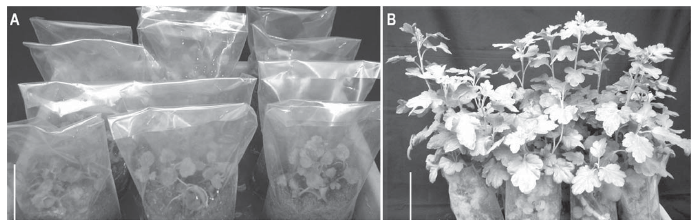
Fig 1. Acclimatization of micropropagated chrysanthemum through sachet technique (A) and the established plants showing growth during their maintenance in the same sachets (B). (Bar = approx. 10 cm)