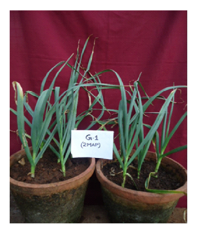
Plate-1: Singapore at 60DAP

Mettupalayam is having partly curved, light green leaves, whereas, flat and dark green leaves were observed in Singapore as seen in high ranges. The pseudostem of Singapore has anthocyanin pigmentation but it was absent in Mettupalayam.