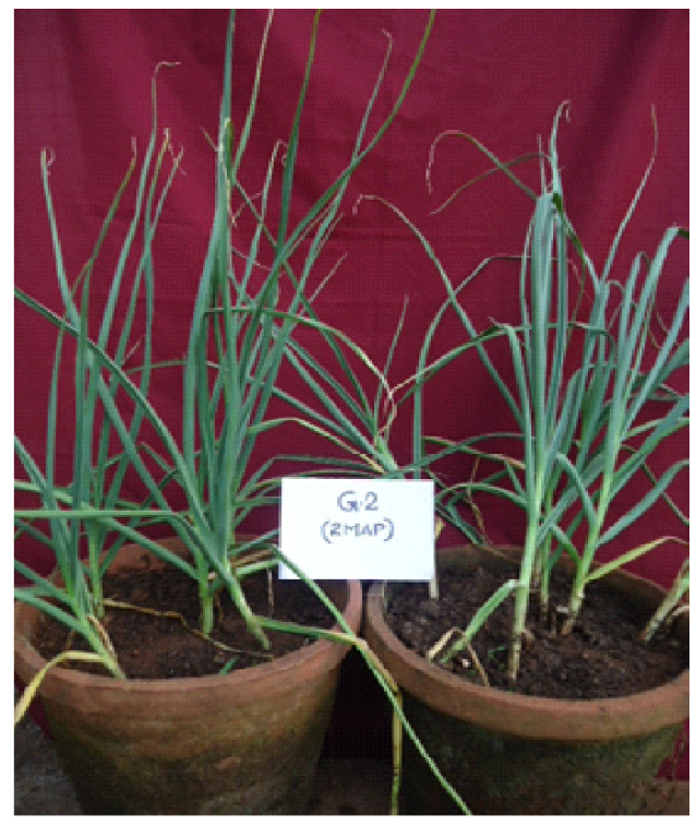
Plate-2: Mettupalayam at 60DAP