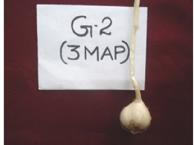
Plate-4: The bulbs of Mettupalayam at 90 DAP

The evaluation of garlic genotypes in the plains of central part of Kerala revealed the genotype Mettupalayam as a better performer. The study also indicate that the short duration genotype Mettupalayam recorded a reasonable bulb weight which is on par