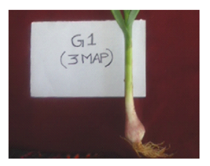
Plate-3: The bulbs of Singapore at 90 DAP

Whereas the bulb weight of Singapore genotype was only 8.30g in plains and it was 21.78g in high ranges. It was observed that the number of cloves per bulb was low when it is grown in the tropical plains. It indicates that the genotype Singapore is not suitable for plains in the present study.