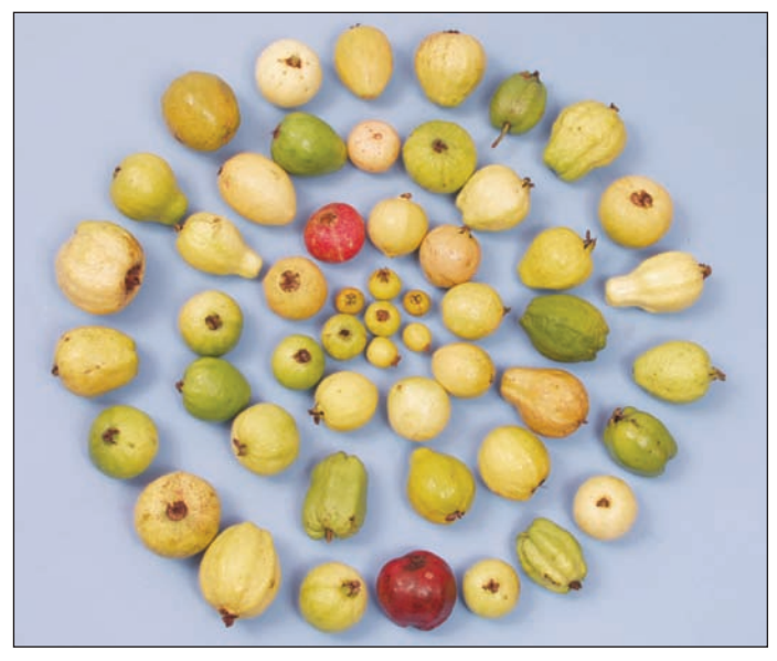
Guava varieties based on shape, colour and weight

Oblong: Oblong, Aneuploid-1, 7-39 EC 147034, Nagpur Seedless, Seedless triploid, Thailand 2, Lucknow 42