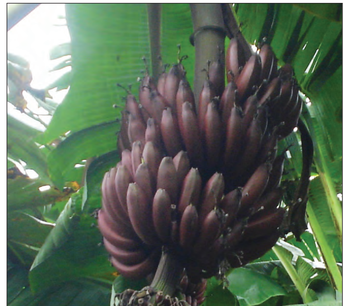
J. Hortl. Sci. Vol. 7(1):1-28, 2012