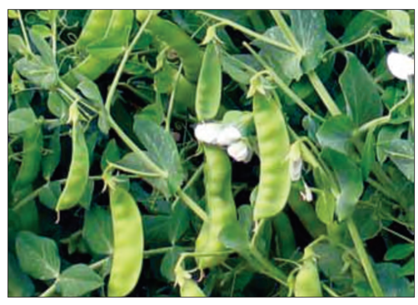
Swarna Tripti (RCER, Ranchi)