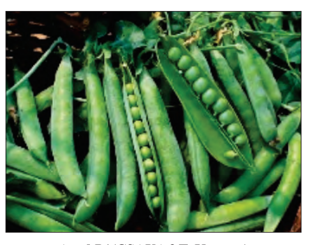
Azad P1(CSAUA&T, Kanpur)