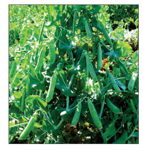
Araka Pramodh (IIHR)