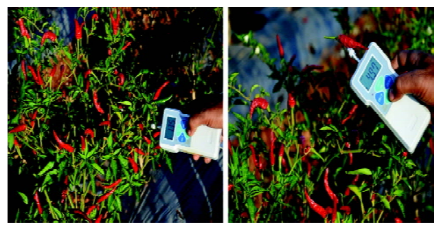
Fig. 2. Images showing fruit detachment force with digital force gauge

The force of detachment or pulling force of fruit to separate from the chilli plants was measured using digital force gauge (Fig. 2), which can measure maximum 50 Newton (N). The digital force gauge used for the experiment was Model No. SF-50, maximum load 50N and the least count of the instrument was 0.01N. The push and pull type digital force gauge was held with one hand one side