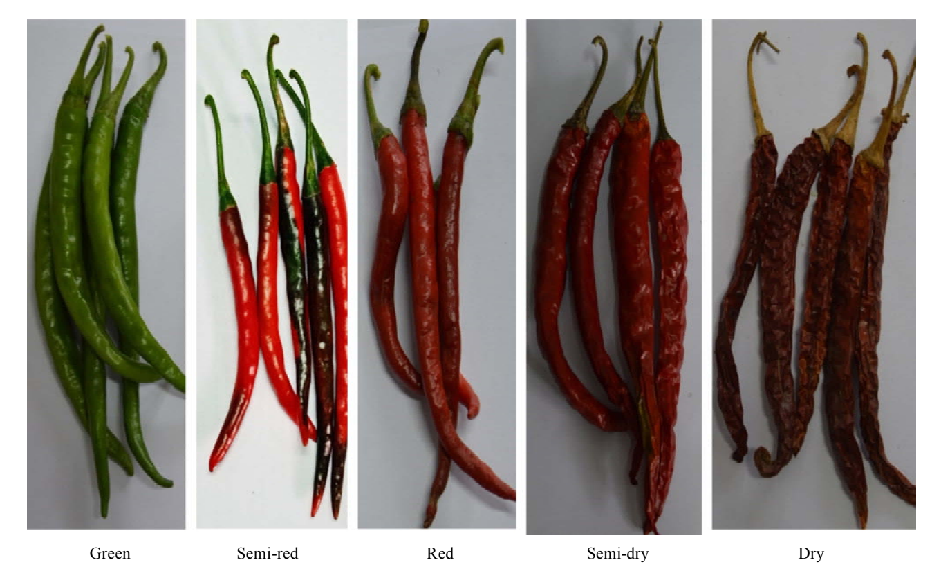
Fig. 3. Image shows different stages of Arka Meghana cultivar

The statistical analysis was carried out for the each observed character under the study using MS-Excel. The mean values of data were subjected to analysis of variance as described by (Gomez and Gomez, 1984).