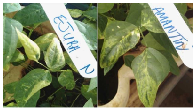
Fig. 1. Mottle mosaic symptoms of seed-borne BCMV-BICM on grow-out cowpea plants in a screen house

All the symptomatic plants of 19 seed lots also gave positive reactions to BCMV-BICM in ACP-ELISA (Table 1). BCMV-BICM transmission based on symptoms among the lots ranged from 0 to 37.8 % (Table 2). Some of the infected seed lots recorded low germination rates. For instance, of the 100 seeds of each seed lot planted, 51 of "Nkoranza-14" and 30 of "Amantin-15," which were positive to BCMV-BICM, germinated. All asymptomatic plants tested negative to BCMV-BICM in ACP-ELISA (Table 1).