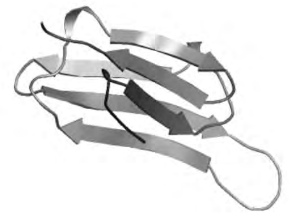
Fig. 2. Quaternary structure of a typical ACD