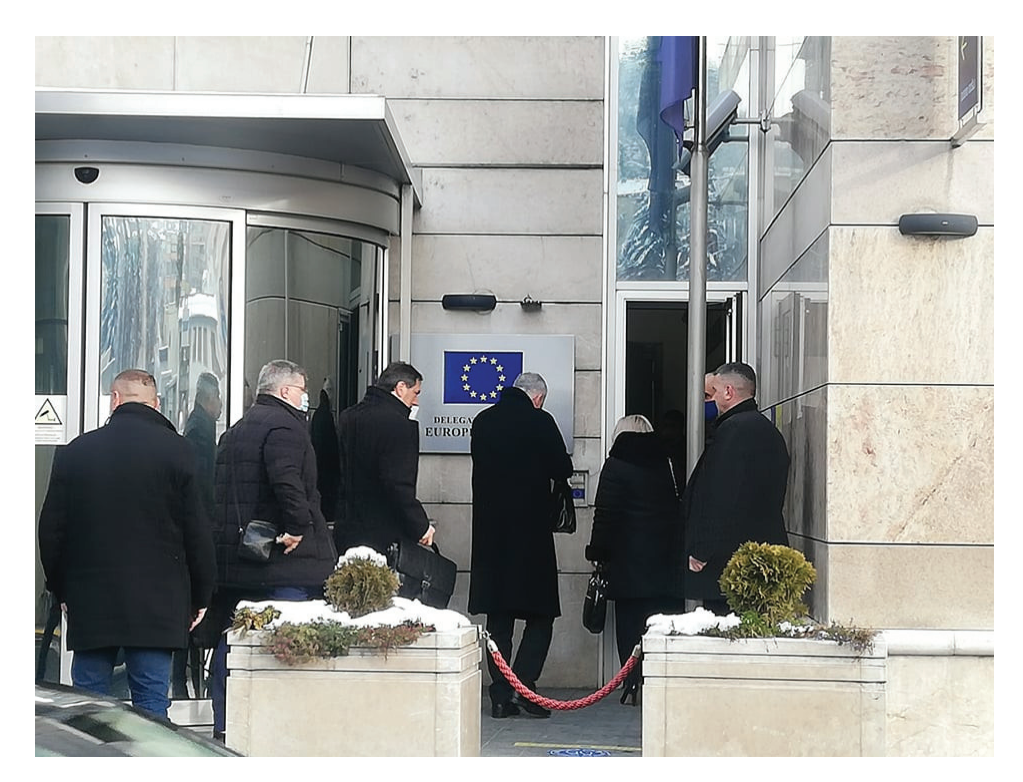
Fig. 3. Arrival of the EU delegation for Election Act Amendments.

The problem of political dialogue led Kosovo to enter negotiations significantly later. After the