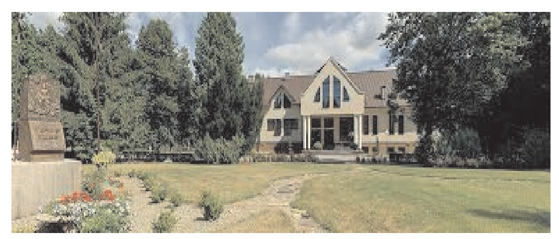
Fig. 3. Theological Institute of St. Joseph, Archbishop Bilczewski

The third group of Evangelical Christians includes All-Ukrainian Union of Christians of Evangelical Faith-Pentecostals and other Evangelical Christians, Union Church of God of Ukraine (Transcarpathian, Chernivtsi oblasts), Center of God Evangelical Christian Church of Ukraine Prophecy (Transcarpathian, Ivano-Frankivsk, Lviv, Rivne oblasts), Cathedral Church of Ukraine, Evangelical Christians "Open Bible" (Volyn oblast), Union of Free Churches of Christians of Evangelical Faith of Ukraine (Transcarpathian, Ivano-Frankivsk oblasts.). Total of these religious organizations is 924 (8.4%), 2 centers and 12 offices, 879 communities (8.4%), 23 mission (27.4%), 6 religious educational institutions (10.2%) 5 universities and one middle school with an enrollment of 795