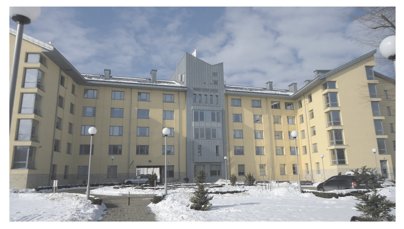
Fig. 2. Ukrainian Catholic University

Ukrainian Catholic University consists of two faculties, Humanities (department: classical, Byzantine and medieval studies, world history, modern and contemporary, modern and contemporary history of Ukraine, (Culture and Languages), Philosophy and Theology; four institutions, Catechetical-Pedagogical, Economic Studies, leadership and management, mental health; lectures of the protection of national minorities, Christian Camp for Children, "My journey with Jesus and Friends" and language schools, English, German, Italian, French and English for high school students (Український католицький...). The university has an enrolment of about a thousand students as of 2016, of whom 274 are undergraduates and 260 are working towards masters degrees (Fig. 2).